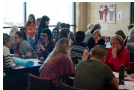
HTAWA PL at Notre Dame University